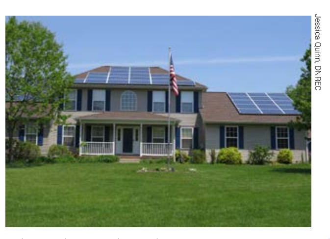
Solar panels on a Delaware home.

should be taken to solidify a long-term greenhouse gas mitigation target, seize opportunities to reduce emissions both internal and external to state government, and engage stakeholders to determine pathways forward that achieve emissions reductions that are both economically and environmentally beneficial.