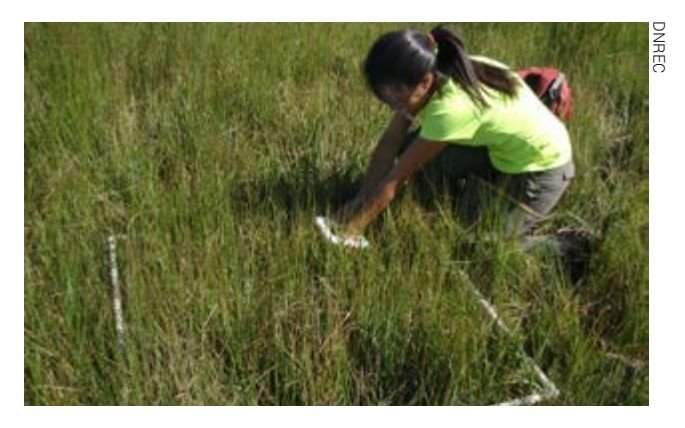
Identifying the biodiversity of Delaware's lands.

The Department of Natural Resources and Environmental Control is responsible for the protection and management of the state's wild-life and natural resources. Maintaining healthy habitats is challenged by current and future impacts of climate change. Resource managers are updating management planning efforts to consider changes in temperature, precipitation, and sea level rise that can affect Delaware's natural heritage. The state's Wetlands Management Plan and Wildlife Action Plan have both been revised to prepare for changing management needs. Delaware Coastal Programs has also