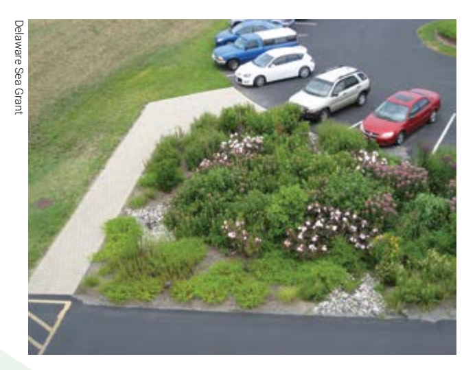
Green infrastructure is used to reduce flooding.

State agencies have proven to be resourceful in finding ways to implement climate adaptation actions within their agencies. One of the innovative approaches to climate adaptation for state agencies is to focus on cross-cutting issues. Through the adaptation planning process, many agencies identified similar or related vulnerabil-