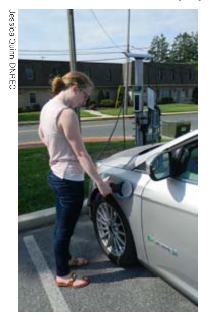
State employee plugging in a fleet electric vehicle for charging.

The Delaware Department of Natural Resources and Environmental Control (DNREC), the Office of Management and Budget (OMB), and the Delaware Department of Transportation (DelDOT) are working together to deploy electric vehicles and electric vehicle charging infrastructure