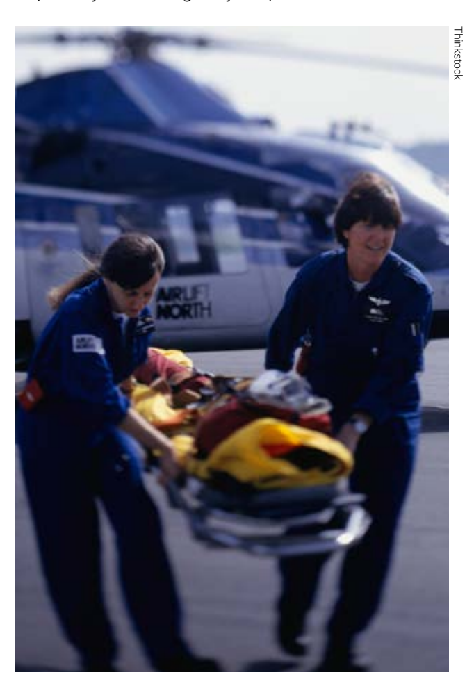
Advanced training prepares Delaware's emergency response team.

Storm surge and heavy precipitation cause flooding—a risk that may become more frequent and more severe as the effects of climate change intensify in Delaware. The Delaware State Police Aviation Section is increasing Delaware's preparedness for extreme weather events by providing advanced training for state troopers and members of the Delaware Air Rescue Team and strengthening the state's capability for emergency response.