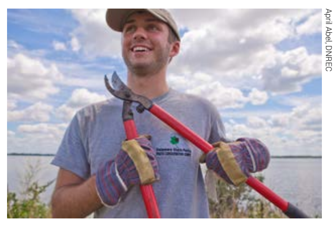
Keeping Delaware's lands healthy.

ities to impacts from increasing temperatures, more frequent extreme heat events, and increased flooding from extreme precipitation and sea level rise.