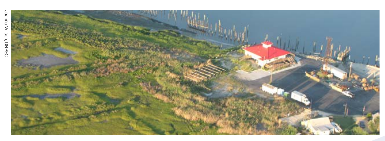
DNREC's DuPont Nature Center at the Mispillion Harbor Reserve.

Sea level rise, increased precipitation, and increasing potential for flood damage to structures and infrastructure were cited in a great number of the "actionable adaptation actions" developed by state agencies. Progress is described in the following pages and in the Adaptation Appendix.