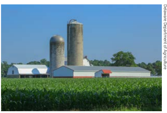
A Felton, Delaware farm enrolled in the Delaware Ag Lands Program.

Agriculture plays a critical role in the efforts to reduce greenhouse gases. Reducing fertilizer usage, using conservation tillage practices, and protecting agricultural lands all assist in reducing greenhouse gas emissions from agriculture. The Delaware Department of Agriculture is working with Delaware farmers to apply these types of practices in the field by promoting permanent land protection through the Delaware Agricultural Lands Preservation Program, supporting nutrient management by encouraging up-to-date nutrient management plans and programs, and supporting healthy trees and forests through the Forest Stewardship and Urban and Community Forestry Programs. Many of these programs have co-benefits that include improved water quality and soil health.