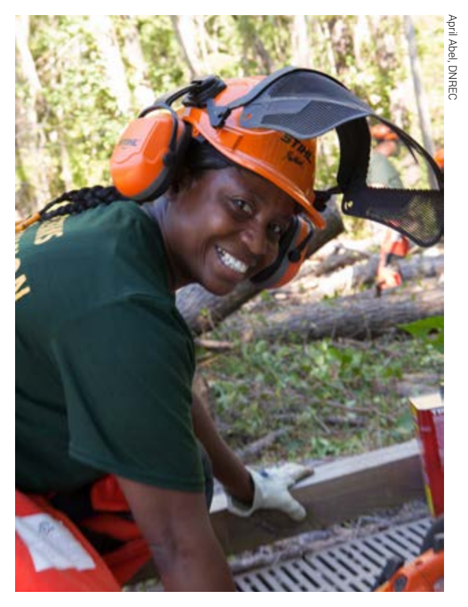
Maintaining access and infrastructure in Delaware's state parks.

Providing public access for fishing and boating is an important asset in a coastal community. But paved parking areas can intensify summer heat and add to problems with local flooding and stormwater runoff during rainy weather. In Bowers Beach, the Department of Natural Resources and Environmental Control is using state and federal grant funds to renovate a