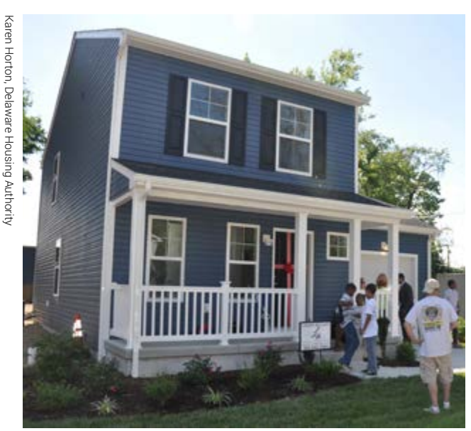
Energy efficient housing makes homes healthier and safer for residents.

Many communities are beginning to consider the impacts of climate change in their local land use plans. Several state agencies, including the Office of State Planning Coordination and the Department of Natural Resources and Environmental Control , support Delaware communities through their planning processes. By providing information and expertise on flood management and climate impacts from heat