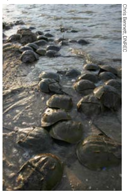
The Delaware Bay is vital to horseshoe crabs.

allow freshwater species to migrate inland over time. Other adaptation efforts include the installation of a living shoreline project on Blackbird Creek and restoration designs for Mispillion Harbor, Milford Neck marsh. and Port Mahon shoreline.