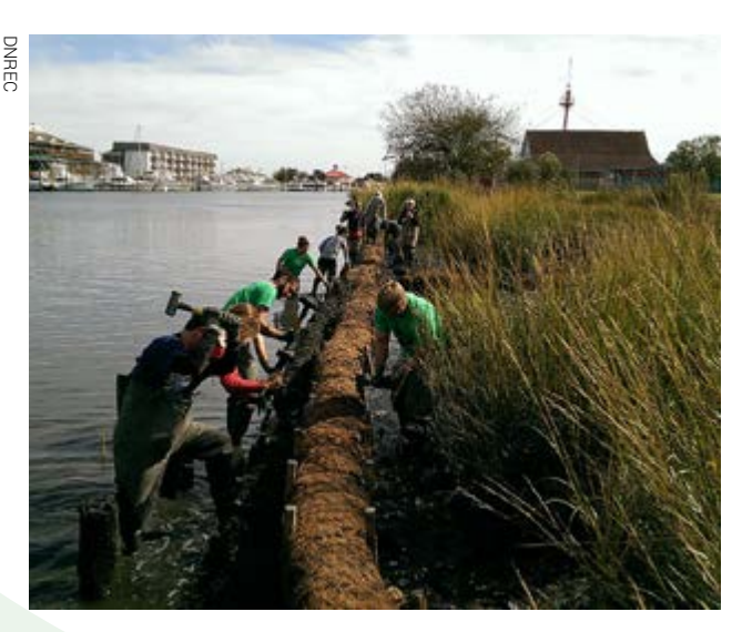
Installing a living shoreline along Lewes Canal.

state-owned parking lot by converting two acres into public green space, adding shade trees and a vegetated buffer. The project will reduce tidal flooding, lessen heat impacts, and add an amenity for the local community. The project also demonstrates green infrastructure techniques that can provide nature-based solutions for other public facilities.