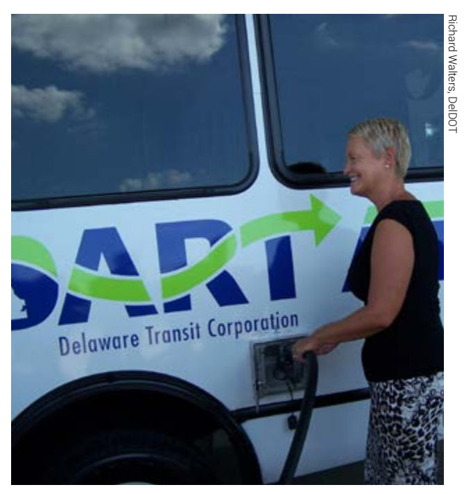
DelDOT Secretary refuels a paratransit bus with propane.

Each year, the Delaware Transit Corporation ( DTC ) provides nearly one million paratransit trips statewide for Delaware residents. DTC purchased five propane vehicles in 2014 as a pilot to determine the feasibility of operating the buses in paratransit service. The success of the pilot resulted in the purchase of 50 propane buses in 2016 and 55 buses in 2017. An additional 20 propane vehicles are planned for 2018,