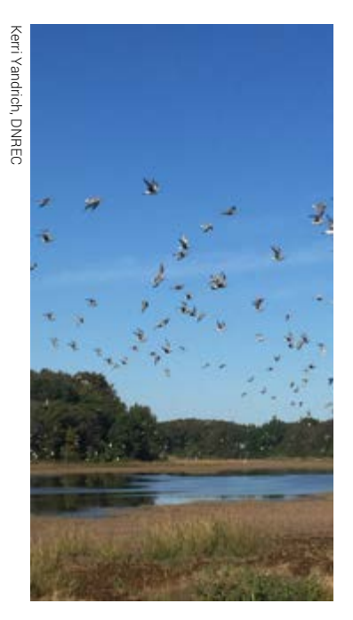
Protecting Delaware's natural areas includes planning for a changing climate.

Delaware's shorelines and wetlands provide critical habitat for migratory waterfowl and shore-birds and also support the state's recreation and tourism economy. Changes in temperature,