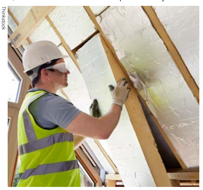
A weatherization professional installs insulation panels into the roof of a home.

The Delaware Department of Natural Resources and Environmental Control's Weatherization Assistance Program has served more than 1,900 Delawareans over the past three years.